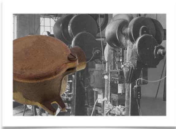
Pic “WISKA-Fer-Messing”: WISKA’s first product: a brass junction box.’