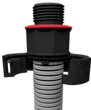
Photo „WISKA Brace System“: The innovative non-metallic fitting BraceGLAND by WISKA convinces by its 360 degrees clasp mechanism.