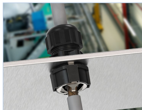
Pict. „WISKA-MagikNUT_Installation“: „EMC shield connection via locknut: MagikNUT by WISKA.“